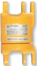
Roller-Bearing Swivel SKLI/SKLU 7/8 - 26 mm