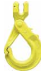
Safety Hook GBK 6 - 16 mm