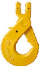
Container Hook BKGC 13 - 16 mm