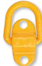
Screw-on Lifting Point SLP 1 - 5 t