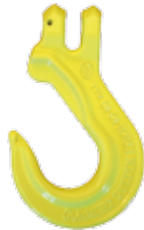
Sling Hook EGK 6 - 20 mm