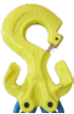
C-grab Duo - CGD 6 - 16 mm