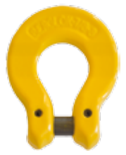
Berglok Chain Coupler BL 6 - 16 mm