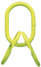
Master Link - MT 3.5 - 90 t