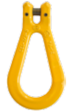
Clevis egglink CEL 7/8 - 13 mm