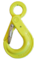
Safety Hook BKD 6 - 20 mm