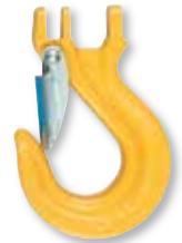
Sling Hook SKN/ESKN Sling Hook SKH/ESKH 7/8 - 20 mm