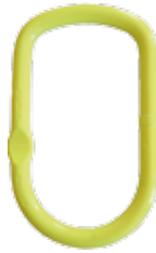
Master Link - MFH 7.5 - 28 t