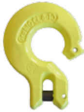
C-Lok CL 6 - 16 mm