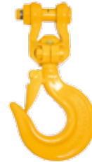
Swivel Latch Hook LKNG 16 mm