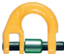
Half-link SKT 7/8 - 32 mm