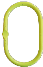
Master Link - MFX 4 - 16 t