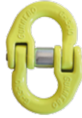
Coupling Link G 6 - 22 mm