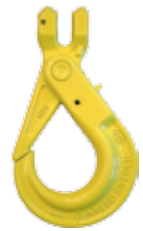
Safety Hook BKG 6 - 20 mm