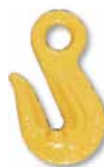
Grab Hook OG 7/8 - 16 mm