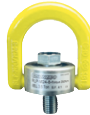
Rotating Lifting Point RLP M8 - M48