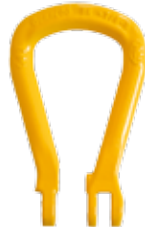
Master link (open) SKO 7/8 - 20 mm