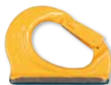
Universal Weld-On Hook UKN 0.75 - 15 t