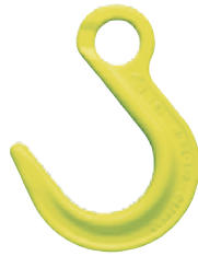
Foundry Hook OKE 7/8 - 22 mm