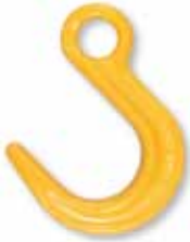
Foundry Hook OKE 26 - 32 mm