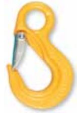
Sling Hook EK/EKN 26 - 32 mm