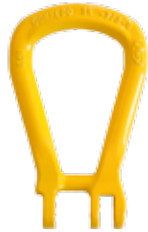
Master link (closed) SKG 7/8 - 20 mm