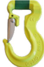
Roundsling Hook RH 1 - 5 tonnes