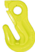
Grab Hook OG 20 - 22 mm