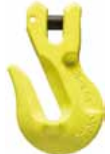
Grab Hook GG 8 - 20 mm