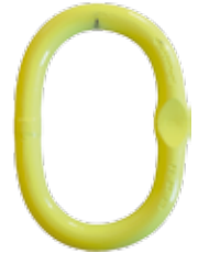
Master Link - MF 1.25 - 25 t