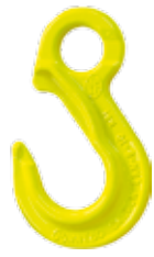
Sling Hook EK 6 - 22 mm