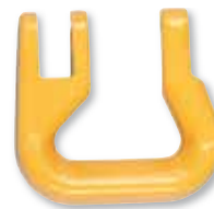
Roundsling coupling SKR 7/8 - 26 mm