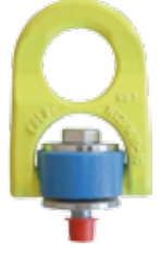
Eye Rotating Lifting Point ERLP M8 - M16