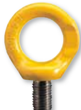
Eye Lifting Point ELP M16 - M30