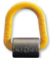
Weldable Lifting Point WLP 1 - 5 t