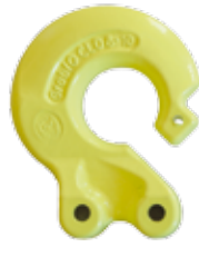
C-Lok CLD 6 - 16 mm