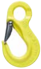
Sling Hook EKN 6 - 22 mm