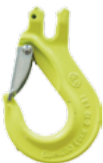
Sling Hook EGKN 6 - 20 mm