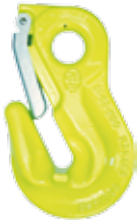
Grab Hook OGN 20 - 22 mm