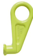
Container Hook CH-3 Left, right and straight 12.5 t