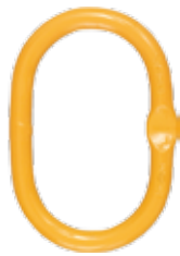
Master Link - M/MF* 2.5 - 56 t