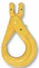
Safety Hook BKG 7/8 - 16 mm