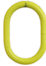
Master Link - M 1.25 - 125 t