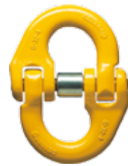
Coupling Link G 6 - 32 mm