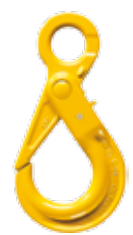
Safety Hook BK 26 - 28 mm