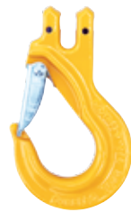
Sling Hook EGKN 7/8 - 16 mm